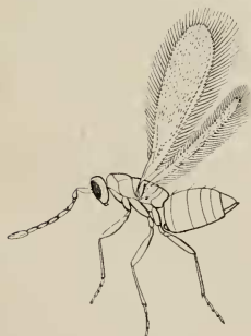
Fig. 19.— Anagrus ovijentatus .

Female.—Length .64 mm., abdomen .36 mm. General colour black; eyes dark red; antennæ blackish, except pedicle below and scape at tip, which are dull yellowish. The legs dull yellowish; coxæ dusky; femora broadly banded with dusky; middle and hind tibiæ dusky except tip and base; last tarsal segments dusky. Abdomen black, very slightly tinged with yellowish at the tip.